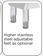
Higher stainless steel adjustable feet as optional